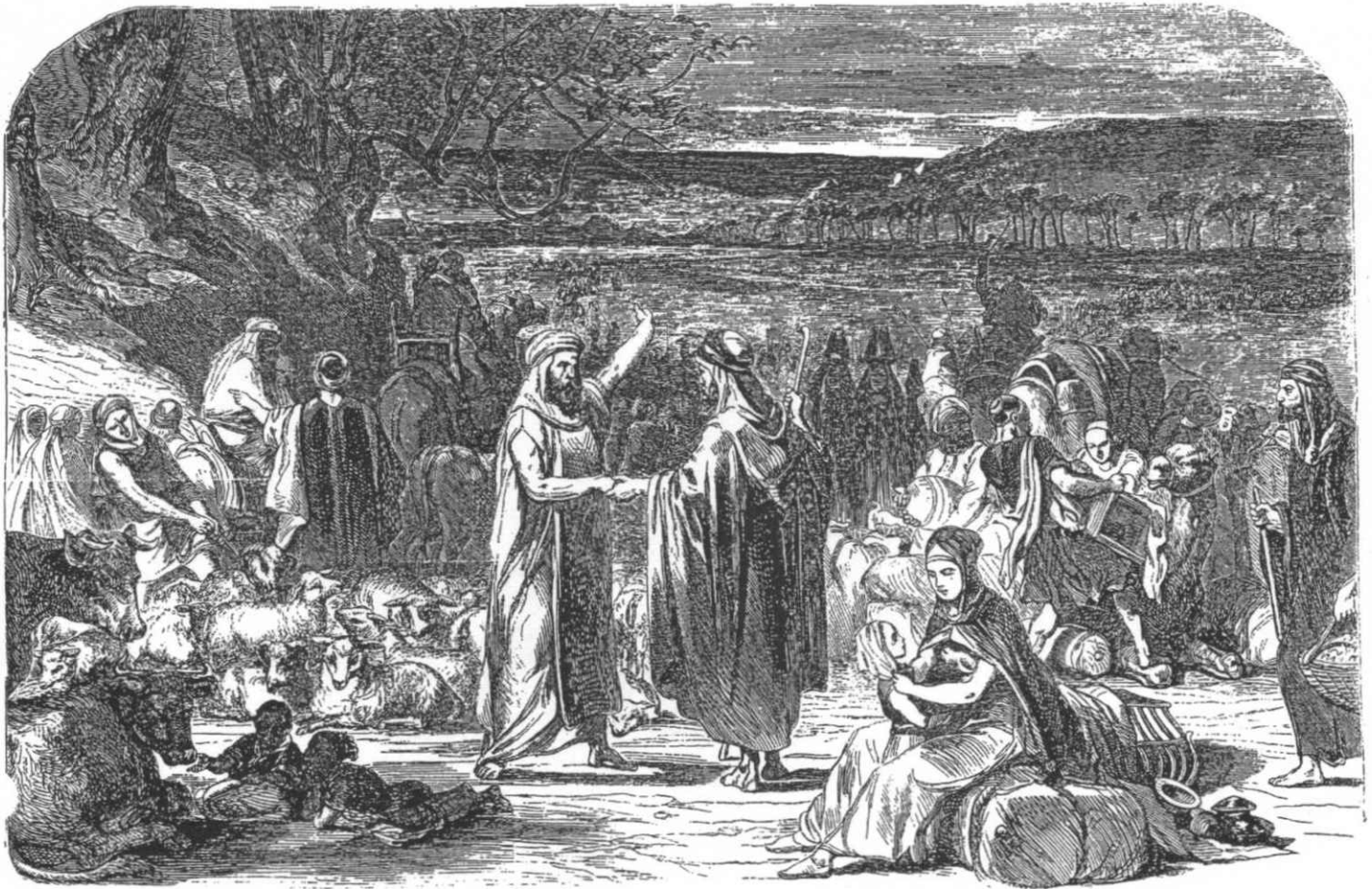
SEPARATION OF ABRAHAM AND LOT.